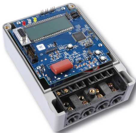
▲ EVM430-F6736 EVM